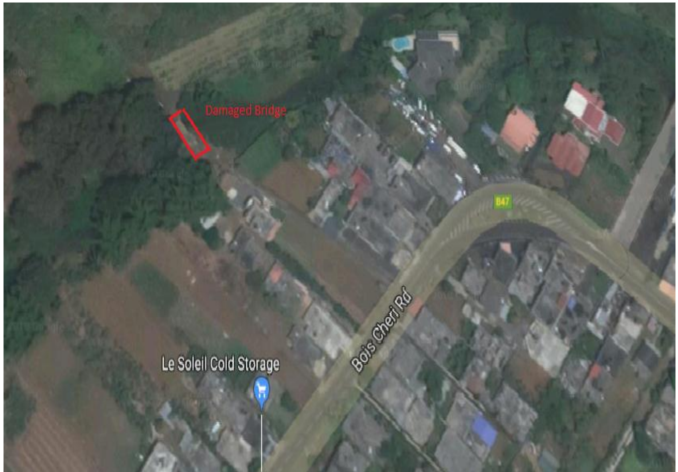
Figure 1: Location Plan

THE DISTRICT COUNCIL OF MOKA CONSTRUCTION OF BRIDGE AT BOIS CHERI RD – ST PIERRE (PONT BD)