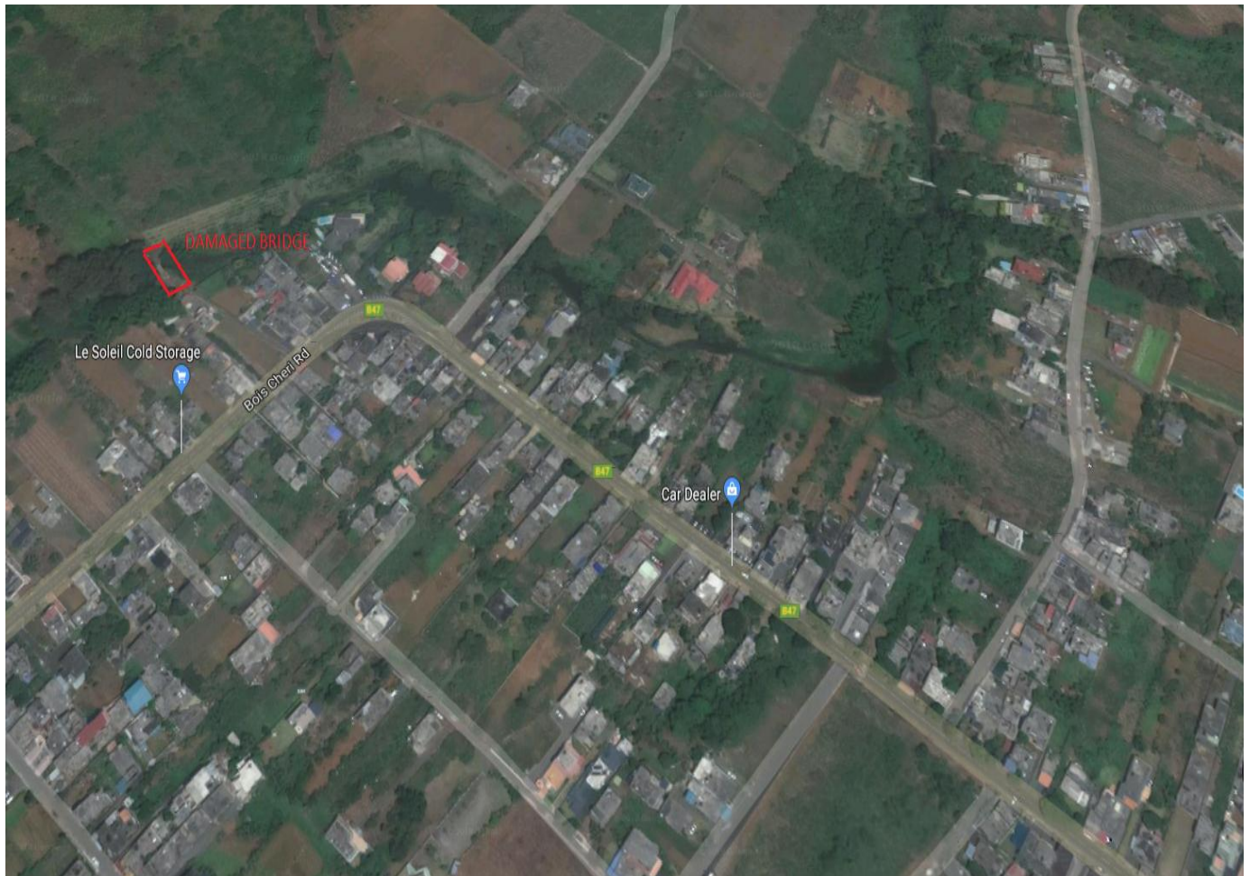
Figure 1: Location Plan